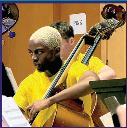
TYSA-Hammond Ashley Bass Festival July 28-31, 2026 University of Puget Sound