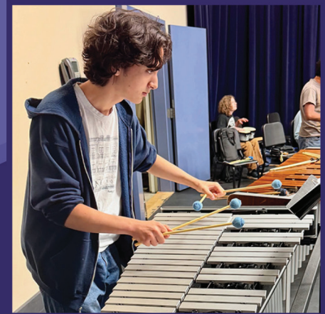
Evergreen Music Festival Session 2 July 19-25, 2026 Central Washington University