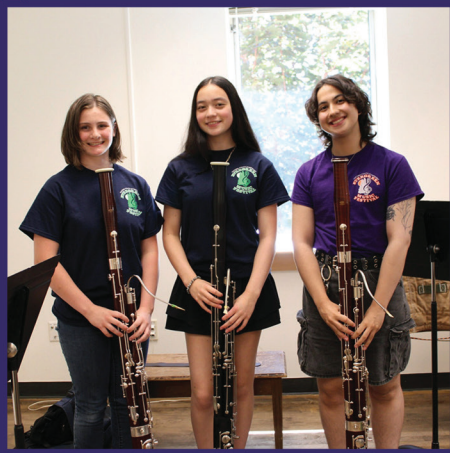
Evergreen Music Festival Session 1 July 13-17, 2026 Pacific Lutheran University