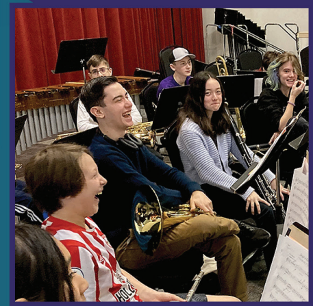
Summer Jazz Orchestra August 6-9, 2026 Tacoma City Theaters