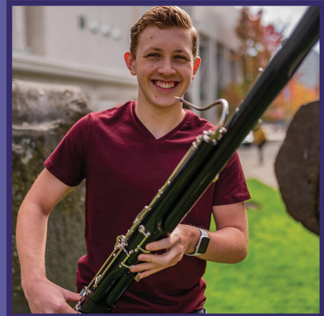
Bassoon Fest NW July 7-9, 2026 Tacoma City Theaters