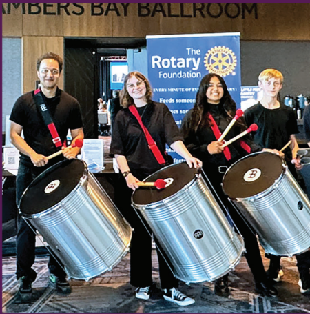
Puget Sound Percussion Festival June 30 - July 2, 2026 Tacoma City Theaters