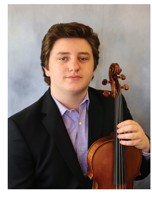
August Triebel Viola Concerto Spotlight