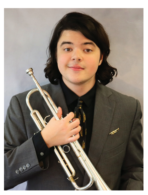
Ben Early Trumpet Concerto Spotlight